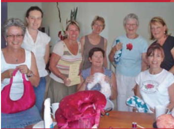
Zontians of the ZC of Noosa working diligently to produce Breast Cushions and Drainage Bags for women undergoing surgery - a district endorsed service project