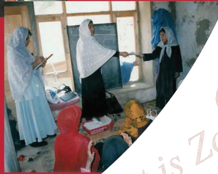
International Service supporting education & health for the women of Afghanistan