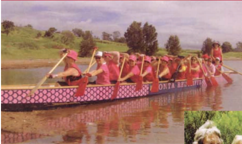
A club project - Provision of Dragon Boat helping Breast Cancer Survivors

Zonta International service – immunization of mothers against maternal neo natal tetanus