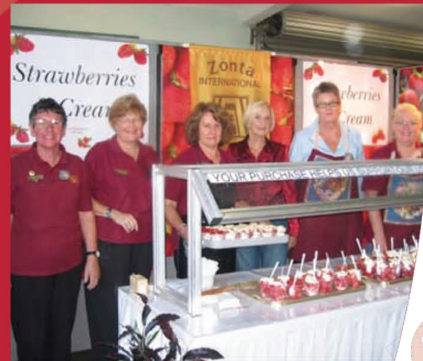
Strawberries & Cream - a major fundraiser for the Cairns Club