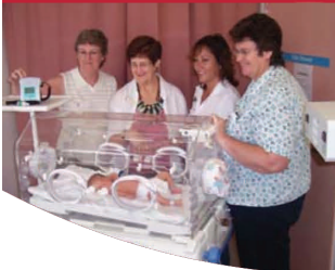
Caboolture Zontians providing equipment for our hospitals

What is Zonta What is Zonta What is Zonta