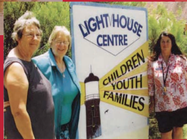
Clubs raise vital funding for crisis care for women and families