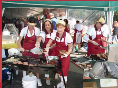
Whitsunday Club Zontians fundraising for their local service initiatives