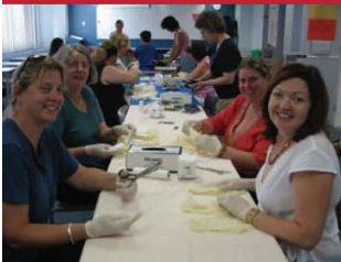
A District Endorsed Project - Assembling Birthing Kits for distribution to developing countries (under an AusAid grant).